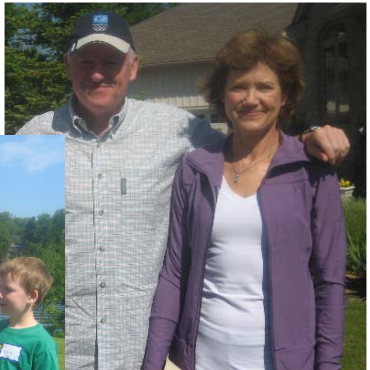
July 2008 Pancake Breakfast